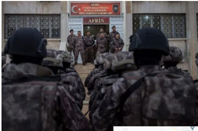
Figure 1. Photo of the entrance of a school in Afrin, which was used as a recruitment center by the Turkish-backed Syrian National Army to recruit Syrian mercenaries, prior to sending them to Azerbaijan to fight against the Armenians of Artsakh.

More specifically, on September 23, 2020, the Hawar news agency leaked the names and pictures of 42 Syrian mercenaries who were recruited in Afrin and deployed to Azerbaijan to fight against the Armenians of Artsakh. 12